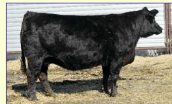
BBS Bases Loaded D608