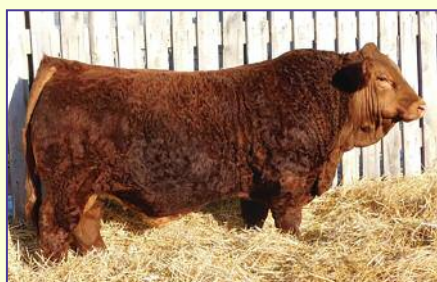
SVS BROOKS 834F