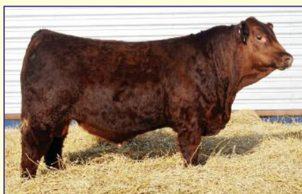
BBS SPRINGSTEEN G11