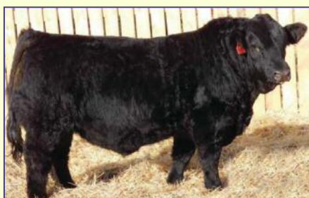
SUNNY VALLEY HAWK 76H