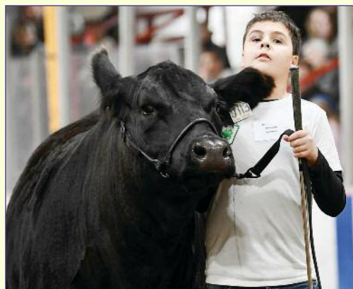
Hudson's State Sale Heifer