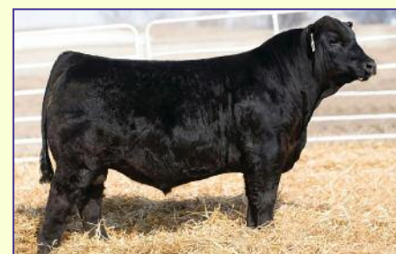
WS PROCLAMATION E202