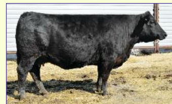
BBS Miss Justice Z7