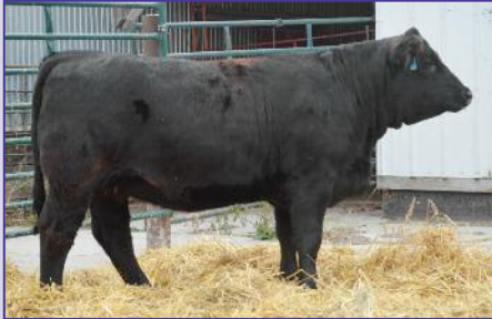
BBS D603 - Sold to TNT Simmentals

In over 40 years we have never before offered an opportunity like this! Our best females have always been retained to maintain the high quality and consistency you have come to expect from BBS. The heifer pen is stacked with pedigrees of performance and cattle that just work. With roughly 70 to choose from, nothing is held back. The hardest part will be picking just one. Several ET daughters by our best donors like BBS Z7 and BBS D608 sired by exclusive bulls like R+ Uppercut, SVS Brooks and Skors Blackjack. All are homo polled and reds non-diluted. This pick could be the start of a new donor cow family at your ranch! Pick to be chosen by April 1, 2023. Reserving a right to one flush of the selected female at our expense. Heifers are located at Kuss's A&L Ranch, 1095 55 th Ave SE, Woodworth ND. Please contact Mark Bata for more information on the heifers.