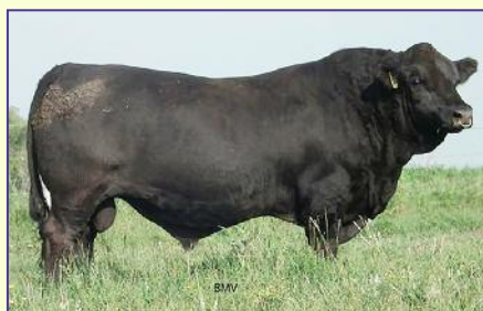
SVS CAPTAIN MORGAN 11Z