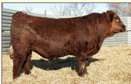
DCR MR HARD IMPACT H69