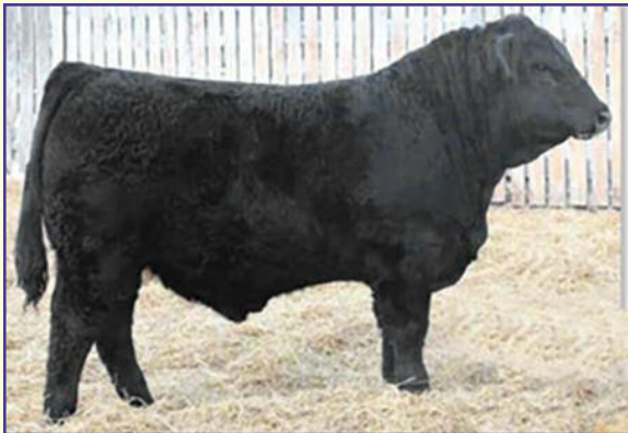
Black Gold Witness. 210J