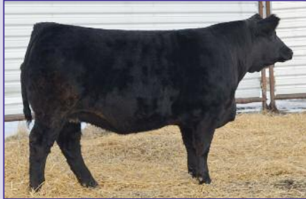
BBS J113 - Sold to Ethan Staigle