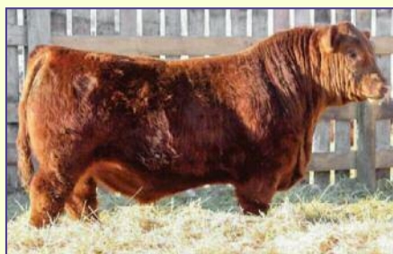
RED MRLA RESPECT 42G