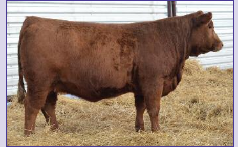
BBS H032 - Sold to Kelly Hoffart