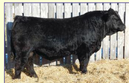
SVS DELTA 912G