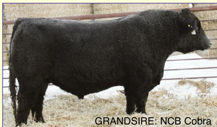
GRANDSIRE: NCB Cobra