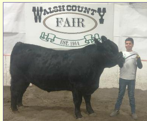
Champion Steer by TT Golden 783G