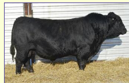
SKORS BLACKJACK 62G