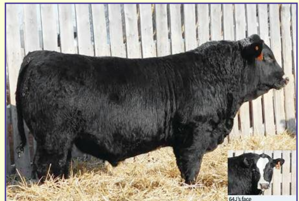
RKTS Oklahoma 64J