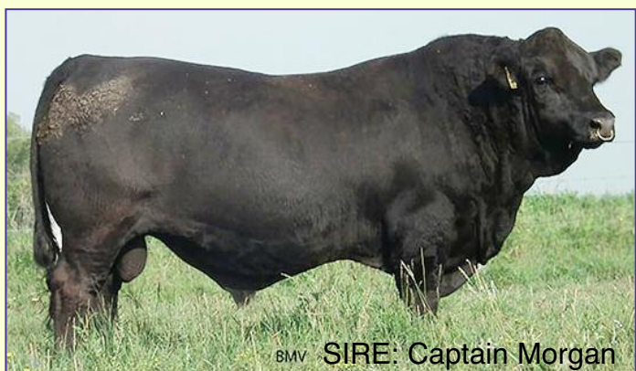
BMV SIRE: Captain Morgan