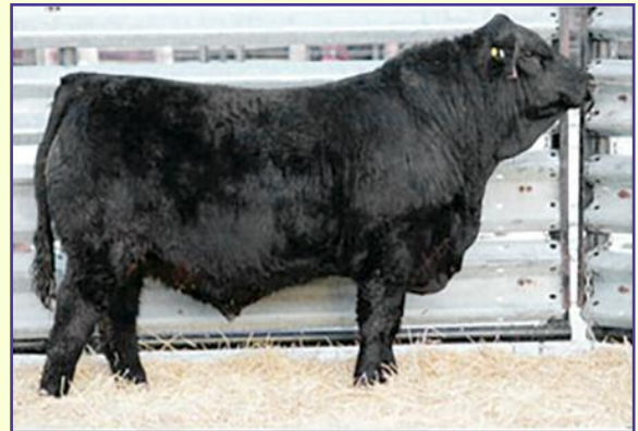
KWA Black Market